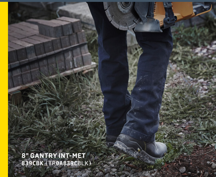
8" GANTRY INT-MET 839CBK (TR0A839CBLK)

Focusing on minimal weight and maximum flexibility, full-length met guards give men and women all the safety they need while maintaining agility. Internal met guards offer critical safety from everyday impacts, while our external met guards provide the highest level of safety when dealing with heavy objects and welding sparks.