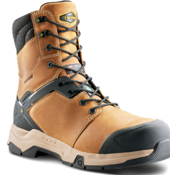
CARBINE 8" CT / CP / EH ■ 4TCRWT (TR0A4TCRWE) WHEAT SIZING / 7-12, 13, 14, 15