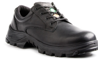
ALBANY CT / CP / EH ■ R835BK (TR835235BLK) BLACK SIZING / 7, 8-11, 12, 13