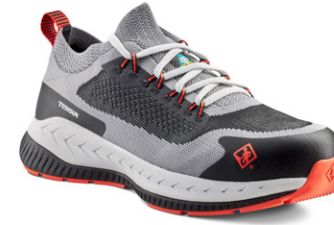
ECLIPSE CT / CP / SD ■ 4T8MBR (TR0A4T8MBLR) BLACK/RED SIZING / 7-12, 13, 14, 15