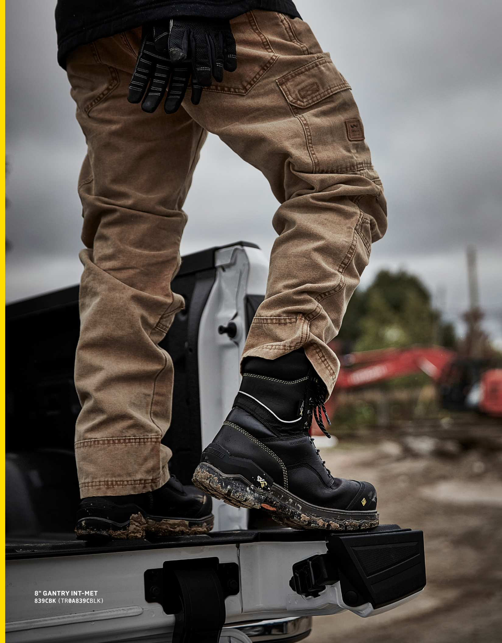
8" GANTRY INT-MET 839CBK (TR0A839CBLK)