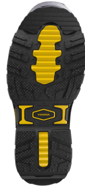
Artist rendering. Actual may vary.

■ 839ABK (TR0A839ABLK) BLACK CT / CP / EH SIZING / 4-16 (FULL SIZES ONLY)