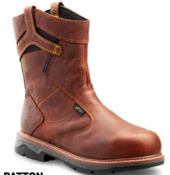
PATTON WELLINGTON INT-MET AT / CP / EH / M ■ 4TCCBN (TR0A4TCCBRN) BROWN SIZING / 3-12, 13, 14, 15