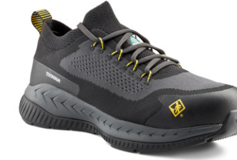
ECLIPSE CT / CP / EH ■ 4T8NBY (TR0A4T8NBLY) BLACK/YELLOW SIZING / 7-12, 13, 14, 15