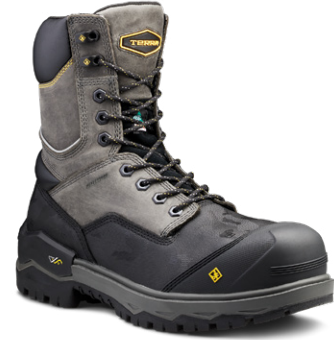
GANTRY 8" NT / CP / EH ■ 4NRQGY (TR0A4NRQGYX) GREY SIZING / 7-12, 13, 14, 15, 16