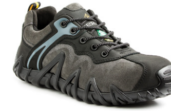
VENOM LOW CT / CP / SD ■ R8185B (TR608185BLK) CHARCOAL/BLACK SIZING / 7, 8-11, 12, 13