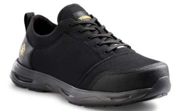
TERRA LITESCAPE NT / CP / EH ■ 4NSKBK (TR0A4NSKBLK) BLACK SIZING / 3.5-12, 13, 14, 15 M/W