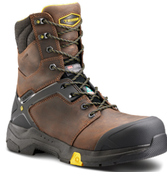
CARBINE 8" CT / CP / EH ■ 4TCRBN (TR0A4TCRBRN) BROWN SIZING / 7-12, 13, 14, 15