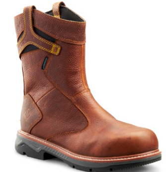
PATTON WELLINGTON AT / CP / EH ■ 4TCBBN (TR0A4TCBBRN) BROWN SIZING / 3-12, 13, 14, 15