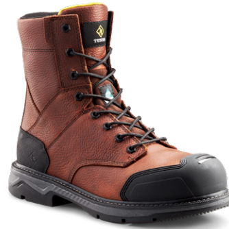
PATTON 8" AT / CP / EH ■ 4NS5BN (TR0A4NS5BRN) BROWN SIZING / 3-12, 13, 14, 15