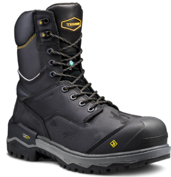
GANTRY 8" NT / CP / EH ■ 4NRQBK (TR0A4NRQBLK) BLACK SIZING / 7-12, 13, 14, 15, 16