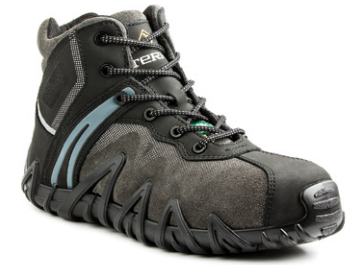
VENOM MID CT / CP / SD ■ R8285B (TR608285BLK) CHARCOAL/BLACK SIZING / 6, 7, 8-11, 12, 13