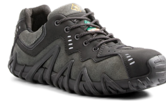
SPIDER CT / CP / EH ■ R8115B (TR608115BLK) CHARCOAL/BLACK SIZING / 5, 6, 7, 8-11, 12, 13