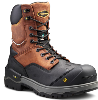
GANTRY 8" NT / CP / EH ■ 4NRQBN (TR0A4NRQBRN) BROWN SIZING / 7-12, 13, 14, 15, 16