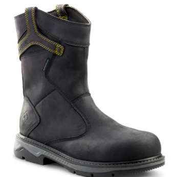
PATTON WELLINGTON AT / CP / EH ■ 4TCBBK (TR0A4TCBBLK) BLACK SIZING / 3-12, 13, 14, 15